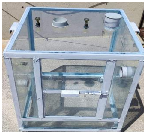
Figure 3: Fabricated smoke exposure chamber

Smoke exposure consists of a square glass box 60 \times 60 \times 65 cm in size. It is equipped with a thermometer and a humidity meter. Two holes on the top of the box exchange air with the outside of the box. Two pipes on the top of the box connect the device Rad 7. An air hole on one side of the box allows smoke to enter (Fig.3).