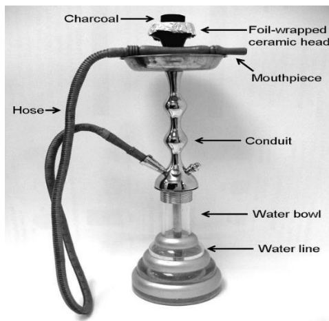
Figure 1: Stature of the used of hookah

The system is held airtight with grommets to ensure proper airflow, and some setups include a diffuser at the end of the stem to further smooth the smoke as it passes through the water. First thing we bring a water pipe bottle, add some water, bring a cup, fill the top of the cup with tobacco, provided the holes in the top of the cup are open, after that we will pack the cup with aluminum foil, Then drill the aluminum foil with a needle and place the cup on the glass bottle, by an electric heater that in the fig. (1). The hookah pump has been used to withdraw the tobacco smoke through the pipe put it in the box (fig.2).