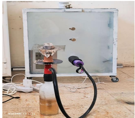
Figure 5: Prepared an exposure hookah smoke