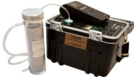
Figure 4: Equipment of RAD-7

RAD7 (Fig.4) is an accurate sniffer that can be used for both short-term and long-term measurements. The instrument is based on a semiconductor detector that measures radon daughters collected with a strong electric field. RAD7 is capable of dissolving the energy of various radon isotopes, radon, and thoron