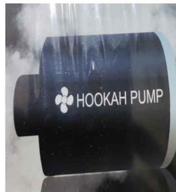
Figure 2: The electric hookah pump

Smoke exposure consists of a square glass box 60 \times 60 \times 65 cm in size. It is equipped with a thermometer and a humidity meter. Two holes on the top of the box exchange air with the outside of the box. Two pipes on the top of the box connect the device Rad 7. An air hole on one side of the box allows smoke to enter (Fig.3).